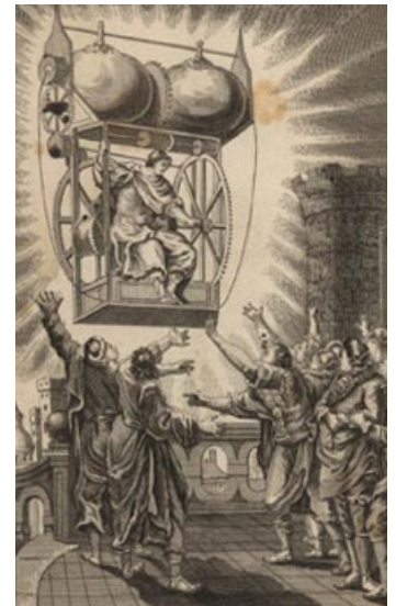
A traveler from far-away Mercury lands in Paris