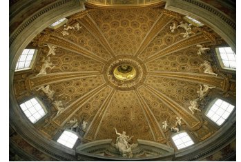
Domes lent architectural form to imagined vastness