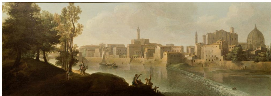
Panoramas played a key role in the eighteenth-century rendering of distance