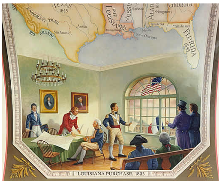
Settlers ask the ceiling to reveal the immensity of the Louisiana Purchase