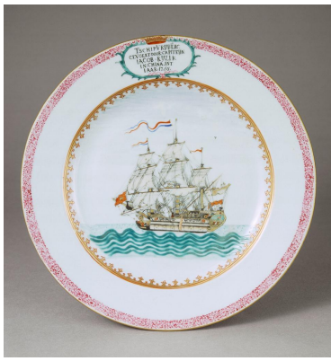
Dinnerware imaged the enthusiasm for distance

6:30 pm: Dinner at Giuseppe’s Italian Restaurant Shuttle transportation from and return to the Hilton Hotel lobby