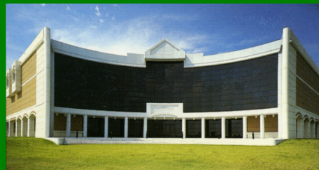
Noel Memorial Library, Shreveport